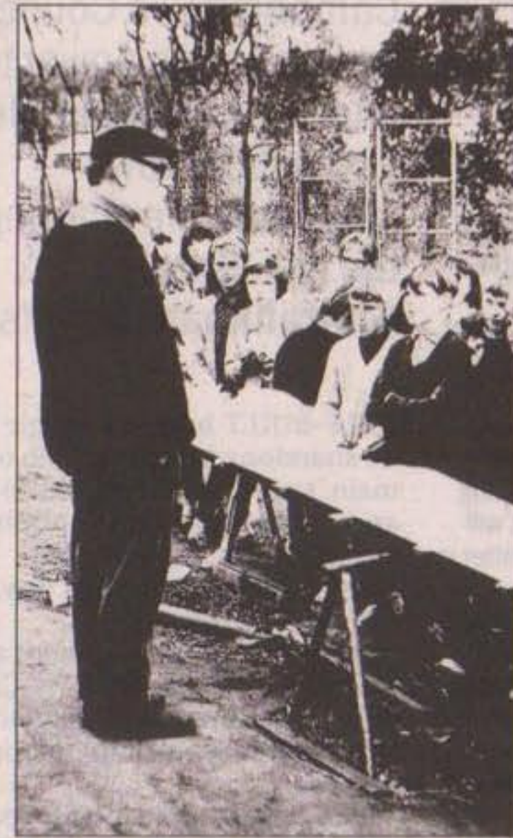
In 1968: The east Minto artist talking to local school students about his work.

The funeral service will be held this morning, March 3 at 9.30am at St Mary's Catholic Church, Concord.